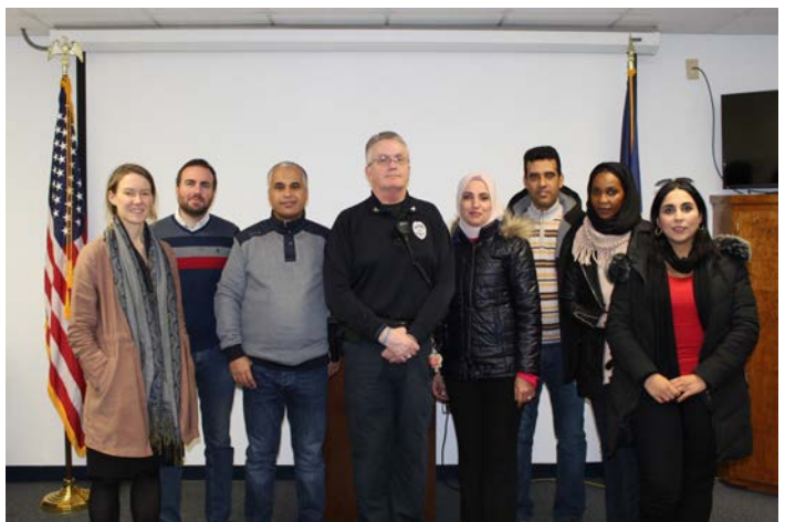
Dignitaries received a tour of the facility, including a housing unit, the Intake/Release Department, and the Medical Department. Afterwards, they had the opportunity to ask further questions of Colonel Witham about the American criminal justice system.