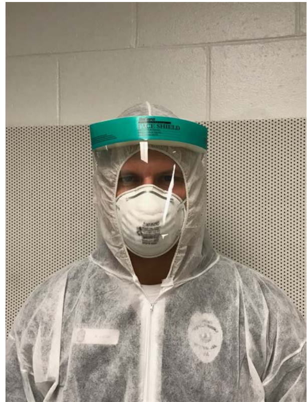
A VPRJ Officer with full PPE.

Masks weren't the only tools used to protect VPRJ employees. VPRJ's Finance Department launched a research and purchase effort for multiple forms of personal protective equipment, including gloves, smocks, shoe slippers, and face shields. VPRJ also procured hand sanitizer, anti-bacterial soap, and other cleaning supplies in abundance. Hand sanitizing stations were placed throughout the facility, allowing employees to easily continue good hygiene practices, and VPRJ's Work Force Team moved throughout the entire facility cleaning and wiping down often touched surfaces and frequently used spaces.