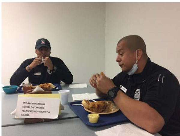
VPRJ Officers observed physical distancing whenever possible, including in Staff Dining.

Communication was also a tool that was used heavily throughout the year to protect members of Team VPRJ from contracting COVID-19. Staff were directed to contact their supervisors if they were feeling ill and told to stay home and seek medical attention; a note from a physician was required for the employee to return to work, along with a corresponding negative COVID-19 test if the physician or the agency ordered a test to be performed. Prior to beginning their shift, staff members had their temperatures screened and logged. If their temperature was elevated, they were not permitted to stay for their shift, and the employee was directed to go home and seek medical guidance. If employees reported feeling ill at work, they were sent home immediately, and also told to see a physician.