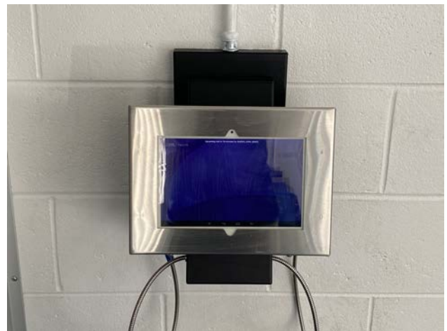
A video visitation station located in the VPRJ Lobby.

Throughout the year, VPRJ worked with Global Tel Link (GTL) to install video stations in the lobby, as well as Intake and Release, which would allow for members of the public to participate in on-site video visitation with their incarcerated loved ones. In October of 2020, VPRJ's video visitation became a reality. Members of the public who wished to visit with their loved ones could do so electronically by scheduling a session online. Each session allowed for 20 minutes of audio and visual visitation and automatically disconnected when the time expired. All sessions were scheduled 30 minutes apart so that once the 20 minute session expired, VPRJ's lobby officer could utilize the final ten minutes allotted in the slot to sanitize the video station and equipment.