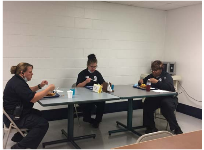
COVID-19 precautions were maintained, including socially distanced seating & mask wearing prior to & after eating. Meals included local favorites like Pierce's BBQ & Jimmy's Oven & Grill.