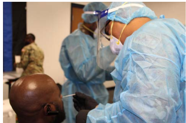
A VPRJ officer receives a COVID-19 test from a Virginia Army National Guardsman.