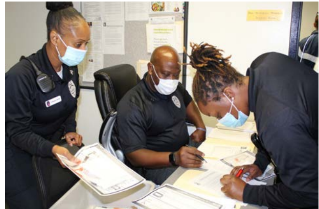
A VPRJ officer fills out paperwork prior to receiving a COVID-19 test.

Throughout 2020, VPRJ held four mass testing events, two of which saw all inmates and staff tested by the Virginia Army National Guard in coordination with the Virginia Department of Health (VDH), and the third, a testing of all staff members by a private medical lab, also through coordination with VDH. A fourth test was conducted after the mass test on December 22, 2020, which tested all those inmates and staff who tested negative initially. As of the final week of December, VPRJ had tested 949 inmates and 436 staff tests for a total of 1385 COVID-19 tests performed in 2020. While most cases among inmates and staff were asymptomatic, those who showed symptoms recovered, and, thankfully, no deaths occurred due to COVID-19 at VPRJ – a reality that other correctional facilities sadly faced.