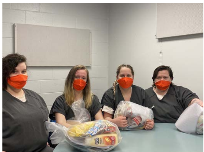
The first group of virtual WAITT program ladies graduated on January 8, 2021. All of these ladies chose to return for the second virtual WAITT program, class 21-1.

Perhaps one of the most disappointing results of the COVID-19 Pandemic was the suspension of volunteer programming inside the jail. For the ladies of the WAITT program, this meant the suspension of their in-housing unit rehabilitation and recovery programming as well as their behavioral modification programming from REAL LIFE. But luckily for these ladies, REAL LIFE was hard at work developing a virtual, self-paced form of programming. In October, a group of ladies was selected to go through a pilot virtual program, where in they would watch DVD modules created and provided by REAL LIFE and then follow up with assignments in a corresponding work book. To ensure proper understanding and progress, REAL LIFE founder and Executive Director Dr. Sarah Scarbrough performed virtual 'check in's' regularly with the ladies. On January 8, 2021, the first group of ladies graduated, and the next virtual group was formed.